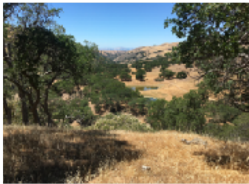
RANCH POND ON 3 CALHOUN SISTERS' RANCH IN ALAMEDA COUNTY.

I was working for Livermore Unified School District and Fremont Unified School District. My involvement in the ag community led to a summer job at the Alameda County Fair working the exhibit side of Commercial and Amateur Wine, Landscape Design, Homebrew, Agricultural Exhibits, some Livestock and whatever else was needed in the Exhibits department. To supplement my teaching income I also worked for Stony Ridge Winery and Concannon Vineyards in their tasting rooms and special events.