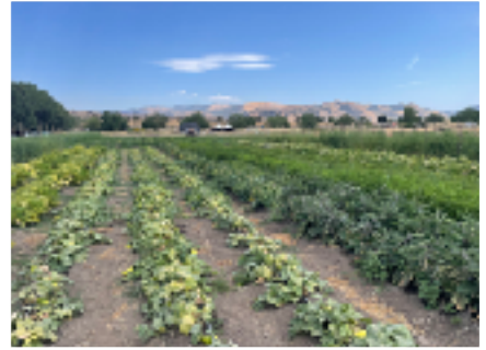
SUNOL AG PARK

Alameda County there are a lot of women-run urban farms that have a powerful impact on their communities. Many are very small scale due to the urban environment, but are doing very innovative work and provide fresh produce in a food desert. I appreciated the opportunity to meet these women and hear about the variety of urban farming. What struck me most was that many urban farmers are paying urban rental and water rates, not agricultural rates. Those at the Sunol Ag Park, with the help of ACRCD, are able to negotiate a lower rate for the water and land while protecting a valuable watershed in Alameda County. The Ag Park was one of the places I had hoped we could have toured had there been a live convention in 2021.